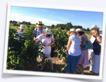
Grand Crew wine appreciation

If you would like to join FiFi, please send a message via the contact page on our website. You will be contacted by email.