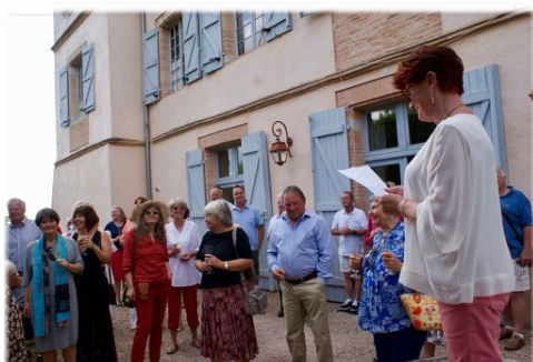
President at annual Apéros at Auty

Above all we are there to support one another.